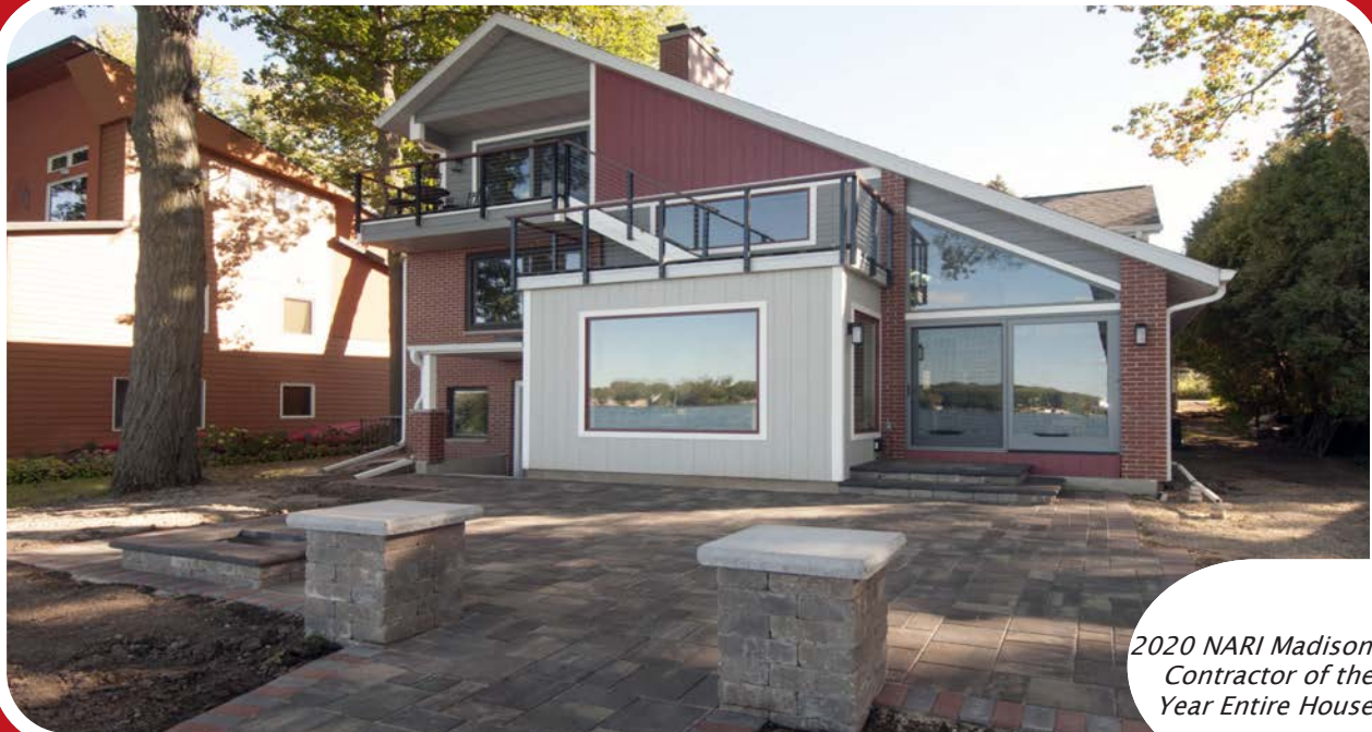
2020 NARI Madison Contractor of the Year Entire House

additions • kitchen and bath remodeling • universal design