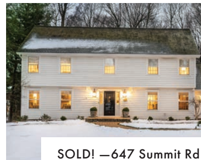
SOLD! —647 Summit Rd