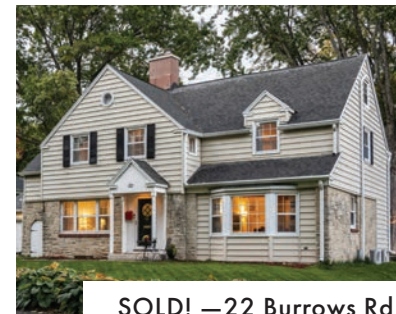
SOLD! —22 Burrows Rd

Sell with the #1 Maple Bluff Sales Team And, 2020 InBusiness Top 10 Real Estate Companies in Dane County