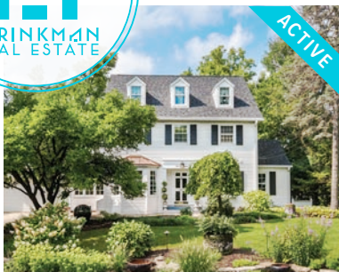
44 BURROWS RD