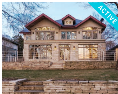
1311 FARWELL DR