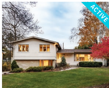
821 LAKEWOOD BLVD