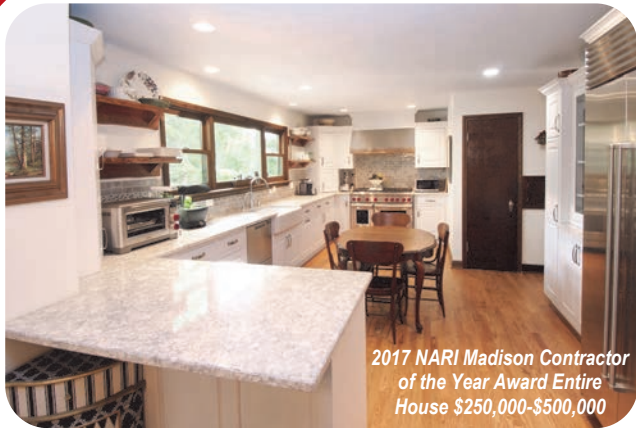
2017 NARI Madison Contractor of the Year Award Entire House $250,000-$500,000

additions • kitchen and bath remodeling • universal design