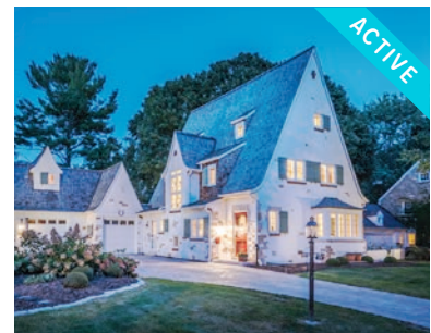
324 LAKEWOOD BLVD