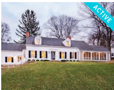
822 FARWELL DR