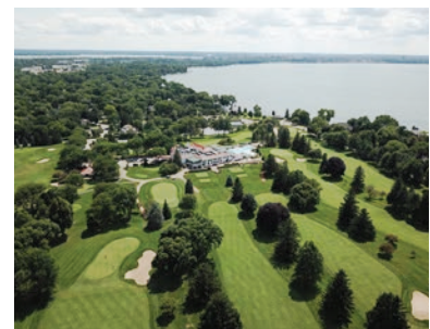
NEW LISTINGS COMING SOON!

Thinking of Selling in 2019? Give us a call (608) 467.9596 // SprinkmanRealEstate.com