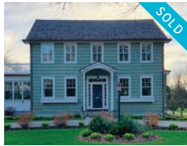
205 LAKEWOOD BLVD