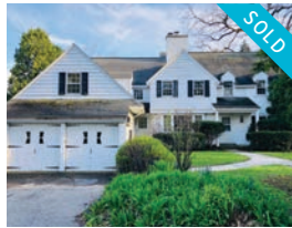
423 FARWELL DR