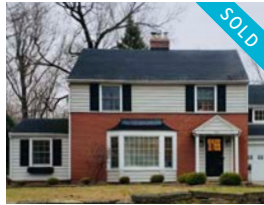
822 BUTTERNUT RD