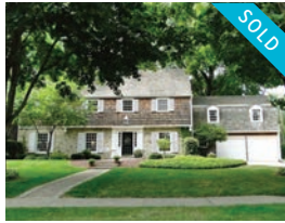
175 LAKEWOOD BLVD