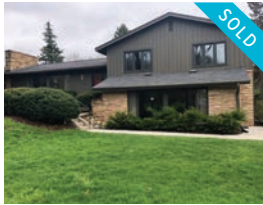
305 DEL MAR DR