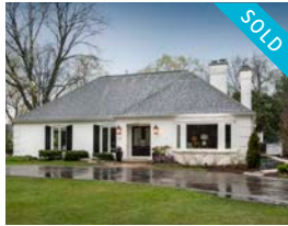
927 FARWELL DR