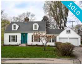
201 WARNER DR