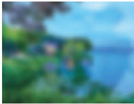
NEW LISTINGS COMING SOON!

Thinking of listing in 2020? Contact Us! (608) 467.9596 // SprinkmanRealEstate.com