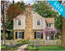
34 CAMBRIDGE RD