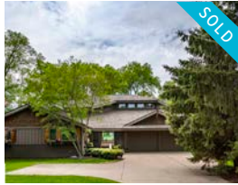
21 FULLER DR