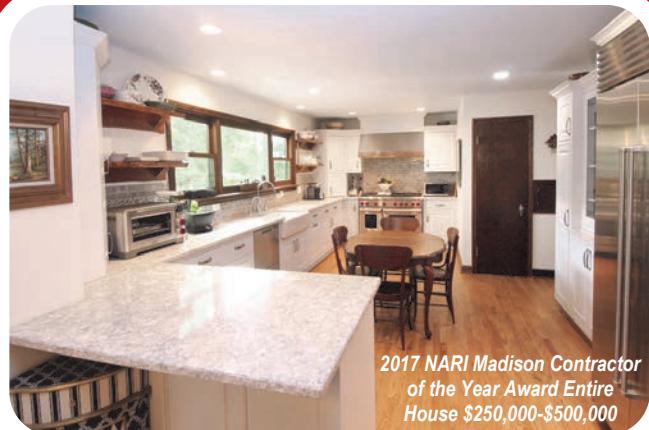
2017 NARI Madison Contractor of the Year Award Entire House $250,000-$500,000

additions • kitchen and bath remodeling • universal design