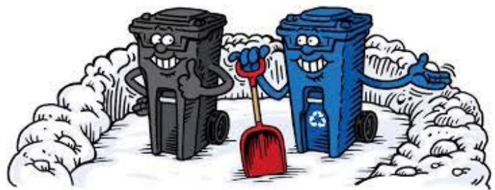
Trash/Recycling Trash pick up is shaded, recycling dates are circled