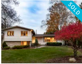
821 LAKEWOOD BLVD