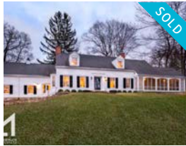
822 FARWELL DR