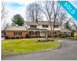
419 COLEMAN RD

With gratitude for a busy 2019, from our Maple Bluff Team!