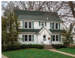
139 KENSINGTON PENDING