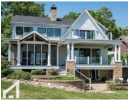
615 FARWELL DR ACTIVE