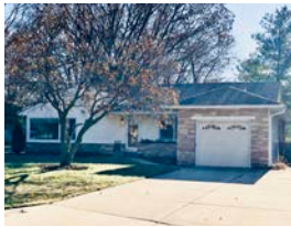
UPPER BLUFF PRIVATE