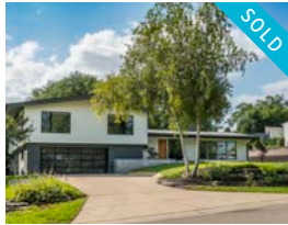
713 LAKEWOOD BLVD