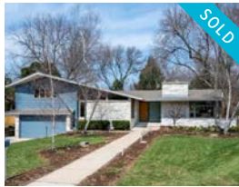
312 NEW CASTLE WAY