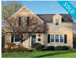
266 KENSINGTON DR