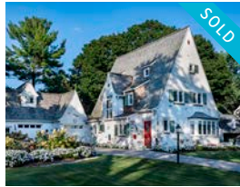
324 LAKEWOOD BLVD