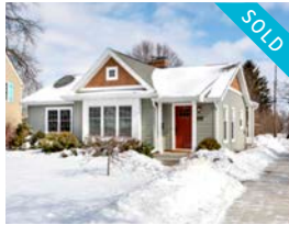
278 KENSINGTON DR