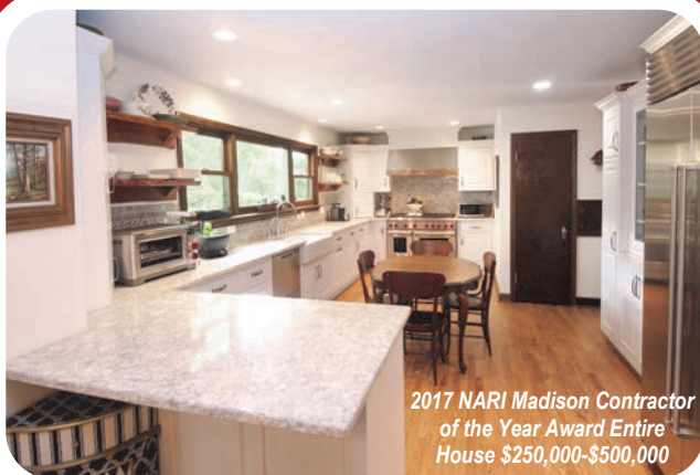
2017 NARI Madison Contractor of the Year Award Entire House $250,000-$500,000

additions • kitchen and bath remodeling • universal design