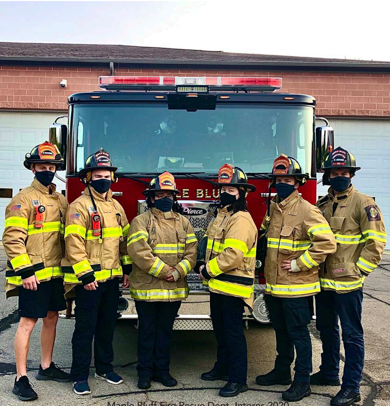
Maple Bluff Fire Rescue Dept. Interns 2020