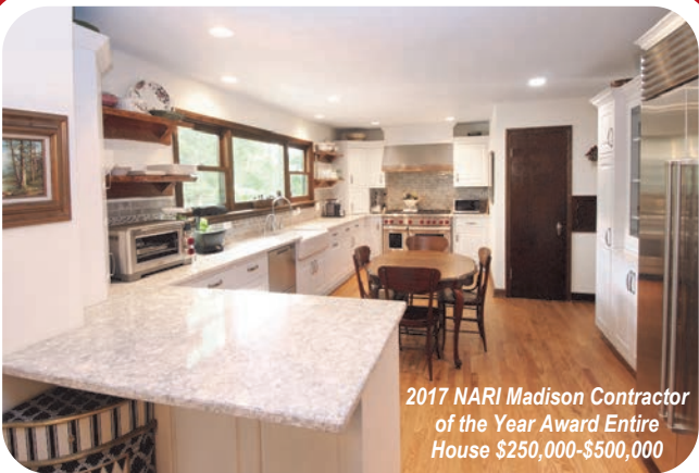
2017 NARI Madison Contractor of the Year Award Entire House $250,000-$500,000

additions • kitchen and bath remodeling • universal design