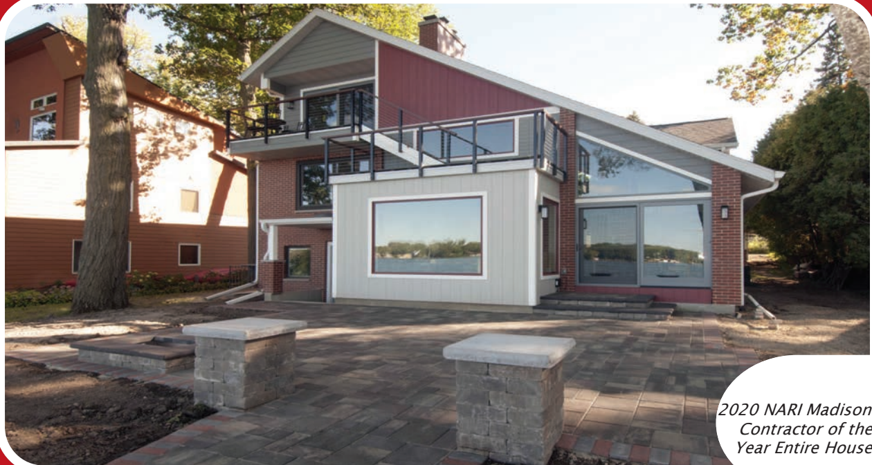
2020 NARI Madison Contractor of the Year Entire House

additions • kitchen and bath remodeling • universal design