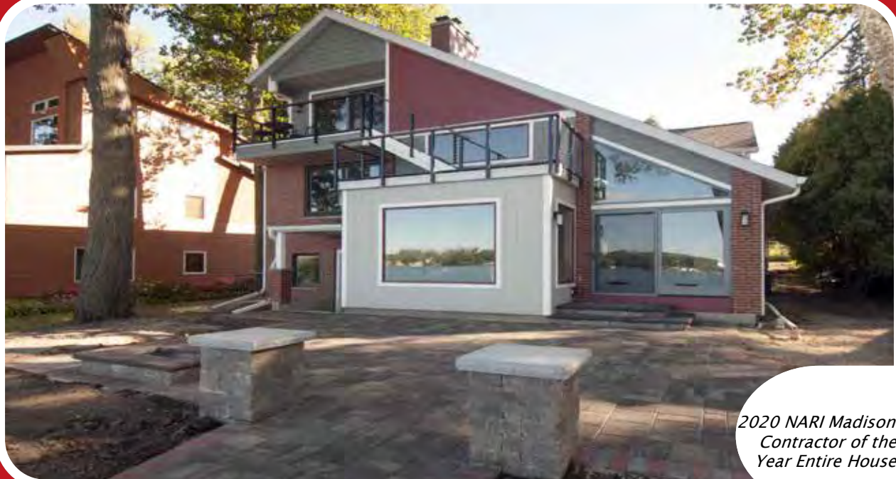
2020 NARI Madison Contractor of the Year Entire House

additions • kitchen and bath remodeling • universal design