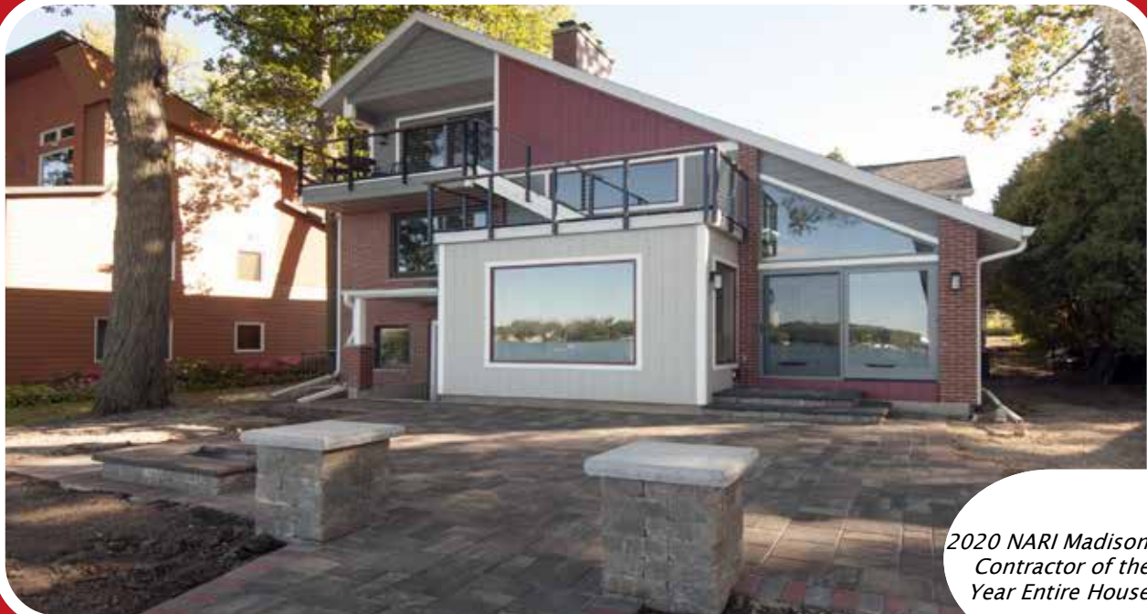
2020 NARI Madison Contractor of the Year Entire House

additions • kitchen and bath remodeling • universal design