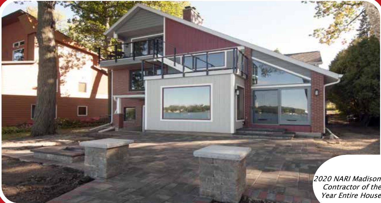
2020 NARI Madison Contractor of the Year Entire House

additions • kitchen and bath remodeling • universal design