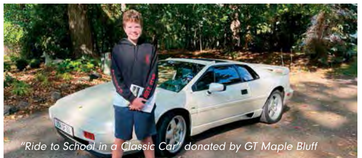
"Ride to School in a Classic Car" donated by GT Maple Bluff