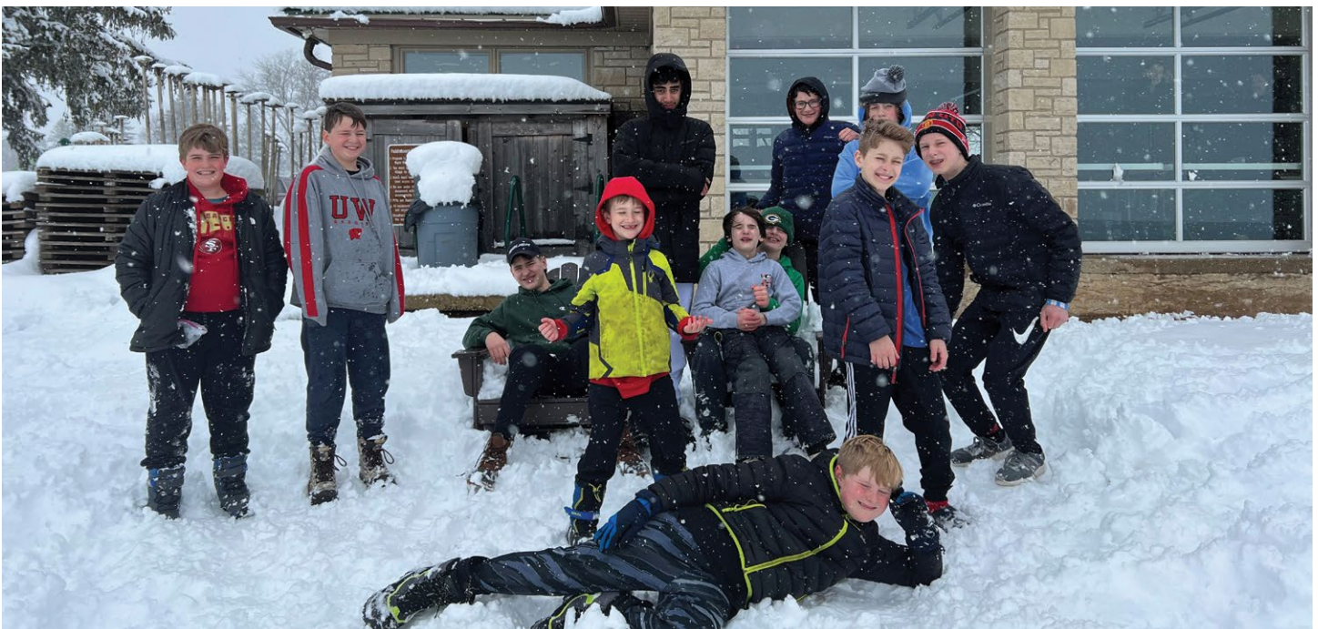
River Food Pantry Breakfast with the Easter Bunny Volunteers