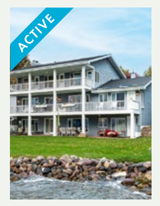
28 Fuller $2,850,000

Our Maple Bluff team has been busy the last few months. If you've been considering a move – now's the time!