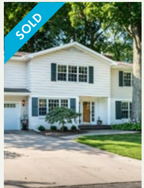
209 New Castle