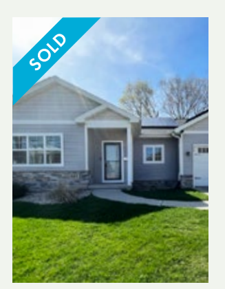
524 N Sherman – BUY