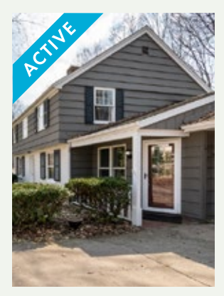
623 Summit $725,000