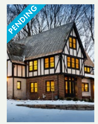
614 Farwell $1,950,000