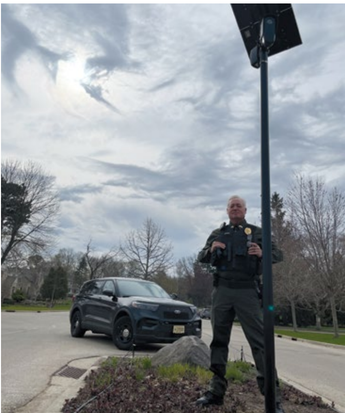
Flock automatic license plate reader (ALPR) cameras are now up and running in the village