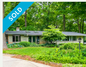
915 McBride BUY SIDE