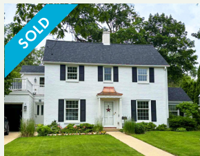
136 Lakewood BUY + SELL SIDE