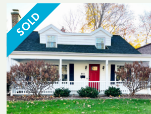
341 Kensington BUY + SELL SIDE