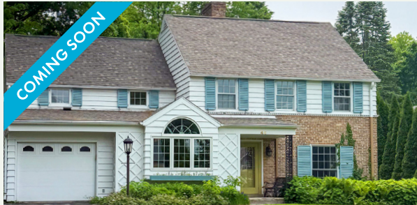
46 Fuller – $1,300,000