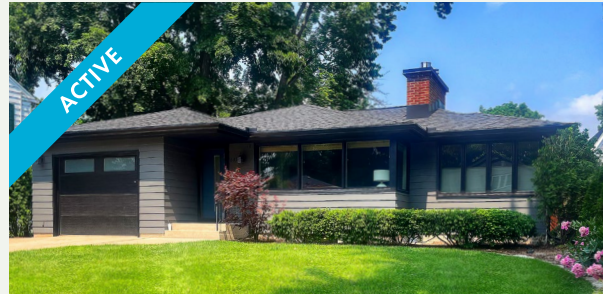
348 Kensington – $775,000