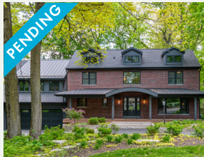
810 Farwell – $2,095,000