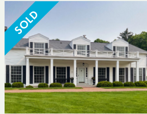
400 Coleman BUY SIDE