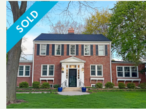
151 Kensington BUY + SELL SIDE