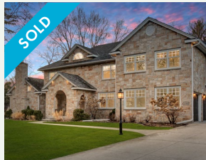
444 Summit BUY + SELL SIDE