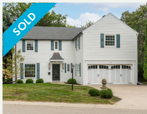
414 Kensington BUY + SELL SIDE