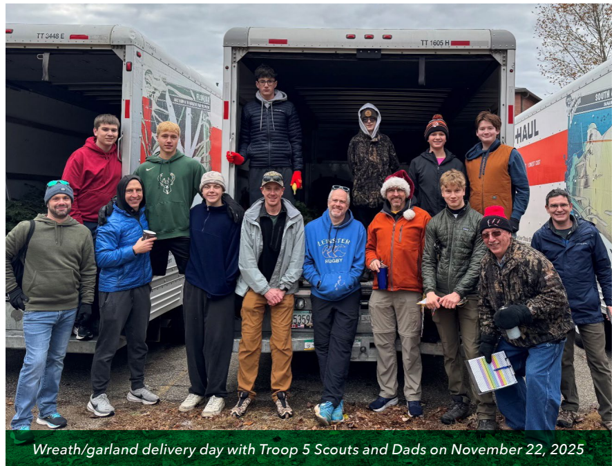
Wreath/garland delivery day with Troop 5 Scouts and Dads on November 22, 2025