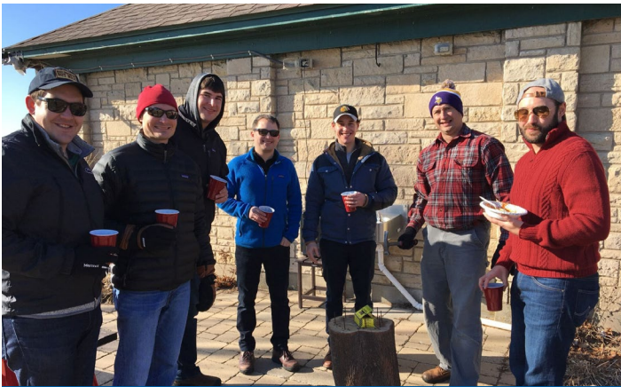
2026 Maple Bluff Event Volunteer Coordinators

As we look back on an incredible 2025, our Parks & Recreation Department is filled with gratitude for a year brimming with memorable events, vibrant programs, and community spirit. From lively summer concerts and family festivals to enriching youth programs. This year reminded us of the power of coming together. None of it would have been possible without our dedicated volunteers and hardworking Village staff, whose passion and commitment bring our community to life. Thank you for making 2025 a year to remember—we look forward to creating even more unforgettable moments in the year ahead!