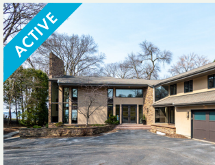
1101 Farwell $4,750,000