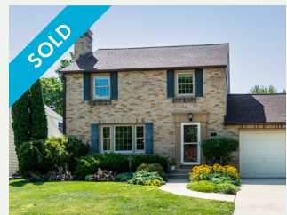
151 Lakewood SELL SIDE

CALL ONE OF OUR EXPERTS TO DISCUSS YOUR 2026 REAL ESTATE GOALS!