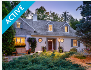
825 McBride $1,300,000