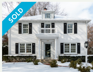
225 Kensington BUY + SELL SIDE