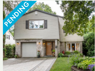
345 Kensington $799,999