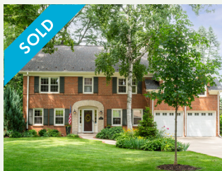
19 Paget BUY + SELL SIDE